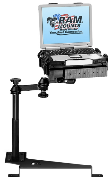
Complete Vehicle Mount RAM-VB-172-SW1

Installs in minutes with no drilling required. Lifetime warranty!