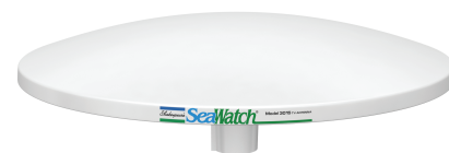
Kit Includes: 3015 panel TV Antenna, 20' RG-59 coax cable, F-connectors, USB, AC/DC power cords

The 3015 antenna is designed for the mobile lifestyle and can be used on marine vessels, RVs, pop-up campers and more! Watch your favorite sports, sitcoms, reality TV, crime dramas, local news, weather, kids programming and more for FREE and in 1080 HD!