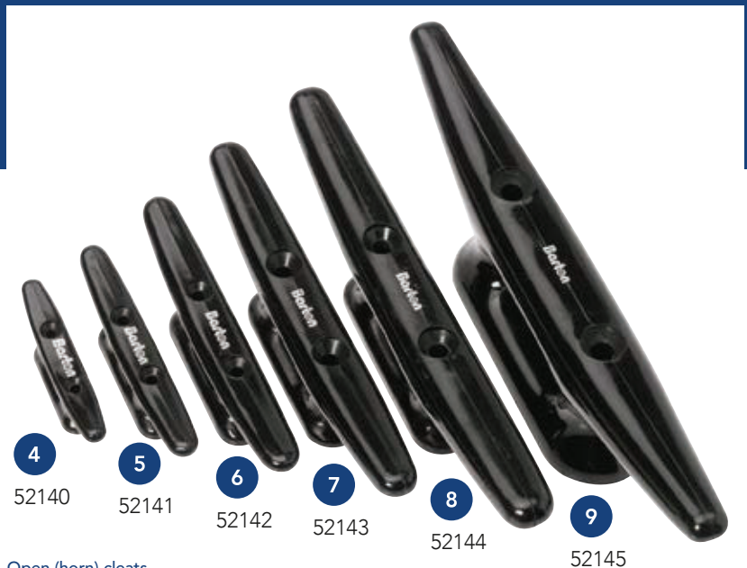
Open (horn) cleats

A wide range of specialised glass filled nylon cleats designed for a variety of uses onboard